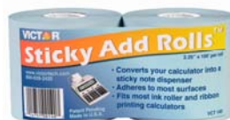
140 Sticky Add Roll